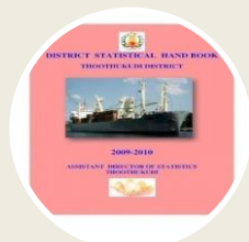
District Census Handbook