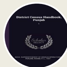
District Handbook of Statistics